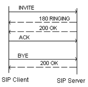
Figure 2: The Typical SIP Call Flow

We have decided to synthetically generate SIP traffic in our IMS laboratory because of unavailability of publicly available SIP traffic datasets. The testbed simulated user agents communicating with each other through a SIP server. The SIP server and user agents are simulated using an opensource SIPp tool [9]. It has the ability to simulate customized SIP scenarios written in eXtensible Markup Language (XML) syntax. The SIPp agents can be controlled at run time using a predefined UDP port. The simulated SIP server and clients follow a typical SIP call flow as shown in Figure 2. To instantiate a call, the SIP client sends an IN-VITE request to the server. When the bell starts ringing on the callee's device, the SIP server sends back 180 RINGING response message. The server sends a 200 OK response message when call is picked up. The caller sends an ACK response and the call has been successfully established. To terminate a call, the client sends a BYE request. The server responds with a 200 OK message which means that the call has successfully ended. In our testbed, we use constant call duration of 60 seconds. We have also simulated random packet losses to simulate the characteristics of a lossy network.